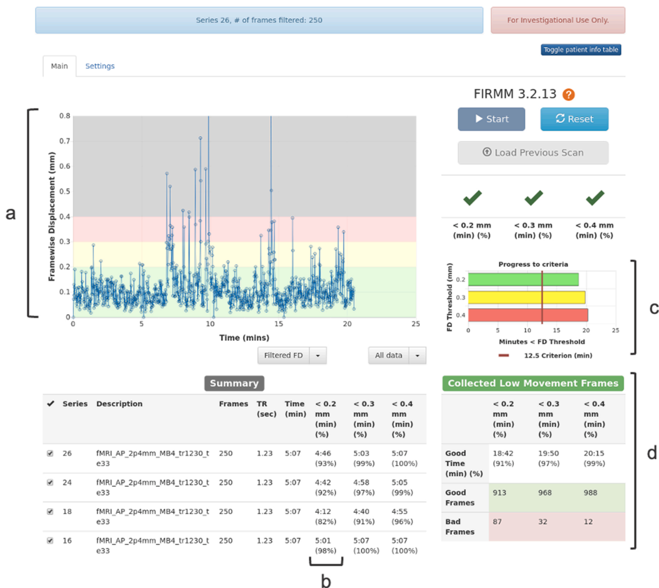
Fig. 1. FIRMM prototype software available in 2017 and used for data collection in Cohorts 4 and 5. (a) Motion Trace: plot of FD values for each frame. (b) Minutes and percentage of fMRI data below 0.2 mm for a given scan run; (c) Progress to criteria: total minutes of data collected compared to a predetermined minimum goal; and (d) Collected Low Movement Frames: running total of minutes, percent, and number of frames of data below the set threshold.

For Cohorts 1–4, MRI data were acquired at the Mallinckrodt Institute of Radiology at WUSM or at St. Louis Children’s Hospital (Smyser et al., 2010, 2016). MRI data for Cohorts 1–3 were acquired on Siemens Trio 3 T MRI scanners with a custom 2-channel quad infant head coil manufactured by Advanced Imaging Research Inc. Functional images were acquired using a BOLD contrast-sensitive echo planar sequence; acquisition parameters can be found in Supplementary Table 4. For Cohort 2, rescans were conducted within several days of the initial scan if movement criteria were not met after data processing. Specifically, motion censoring procedures were applied such that frames with